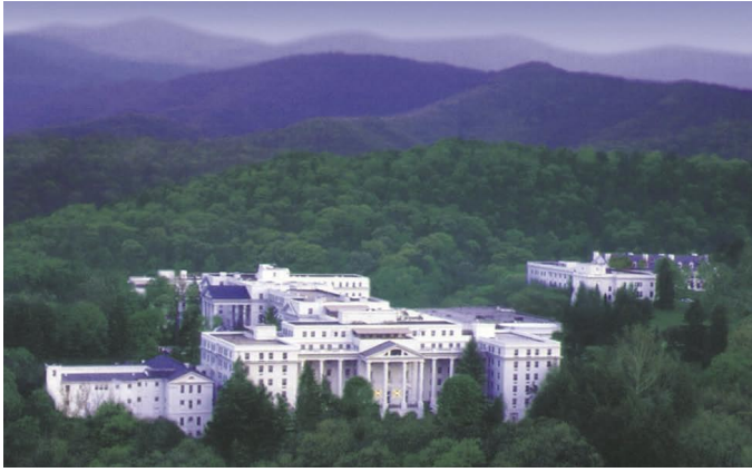
The Greenbrier, in White Sulphur Springs, West Virginia, the site of our July 2007 gathering.